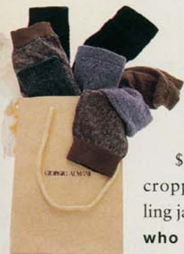
Armani socks, $14-$16

a little something: $4.50 soap the big time: $1,720 women's cropped yellow shearling jacket who loves emporio: Leonardo DiCaprio, Stephen Baldwin, Neve Campbell