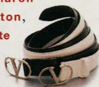
Valentino logo belt, $135

cool perks: Check out Vizione, his sportier line, available in the spring