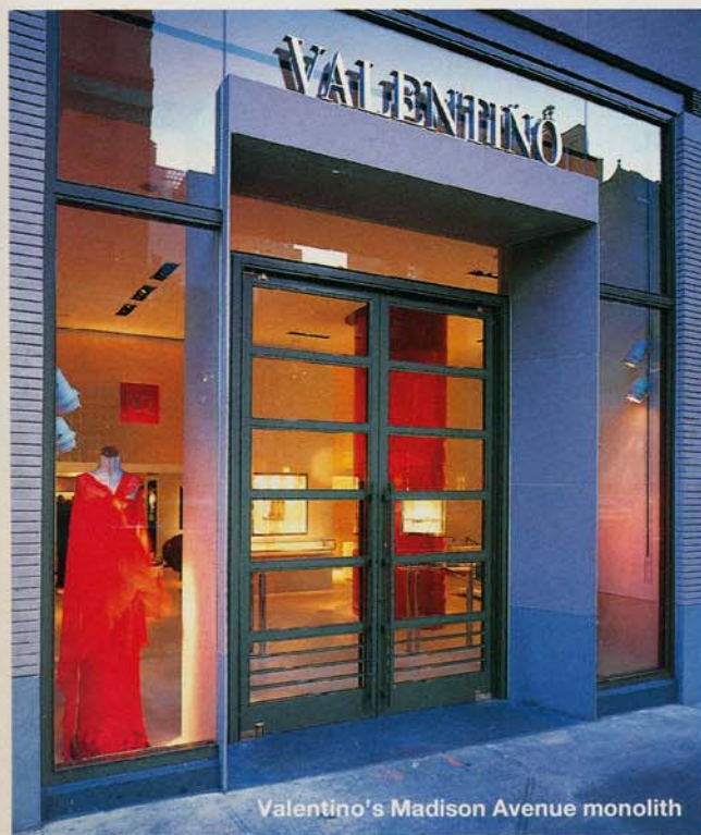
Valentino's Madison Avenue monolith