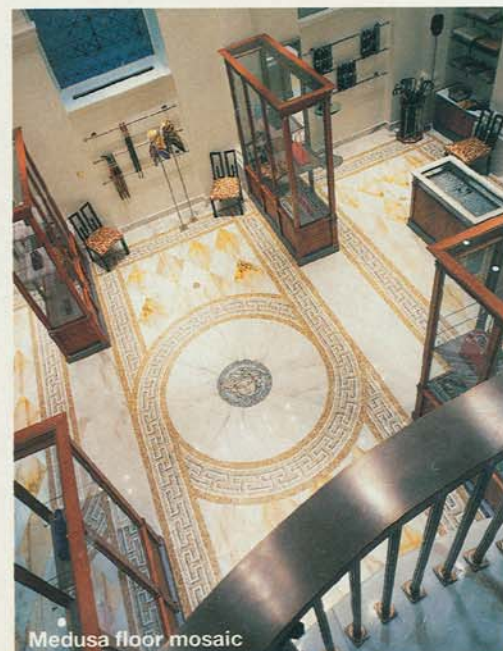
Medusa floor mosaic

Versace's largest store is nestled in the last of the Vanderbilt townhouses that once populated Fifth Avenue; mille grazie , Gianni, for restoring this 90-year-old beauty, a New York City landmark. This style temple (designed by Laboratorio Assoliti) is the epitome of Versace opulence: The white-marble-and-limestone and Corinthian column façade encases five floors, connected by a marble staircase. Enter via a Milanese-made floor mosaic featuring Medusa's head, Versace's signature emblem, which shows up all over—on buttons, rhinestone cigarette lighters, and a 3-carat diamond-encrusted ring in the fine-jewelry salon. As for the clothes, go ahead and gawk: Why not, when there are $699 pony-skin ankle boots, a $23,000 bright green croco-