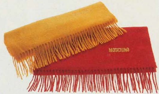
Signature scarves, $55

top-of-the-line collections for men and women. Drool over everything from floor-length striped satin evening gowns to buckled alligator loafers