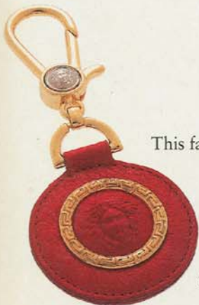
Versace keychain, $36

hasn't seen this much street glamour in a long time