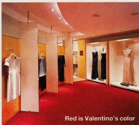
Red is Valentino's color

a little something: A woman's belt for $135 the big time: $13,000 Valentino Boutique crystal-bejeweled black, sheer halter gown